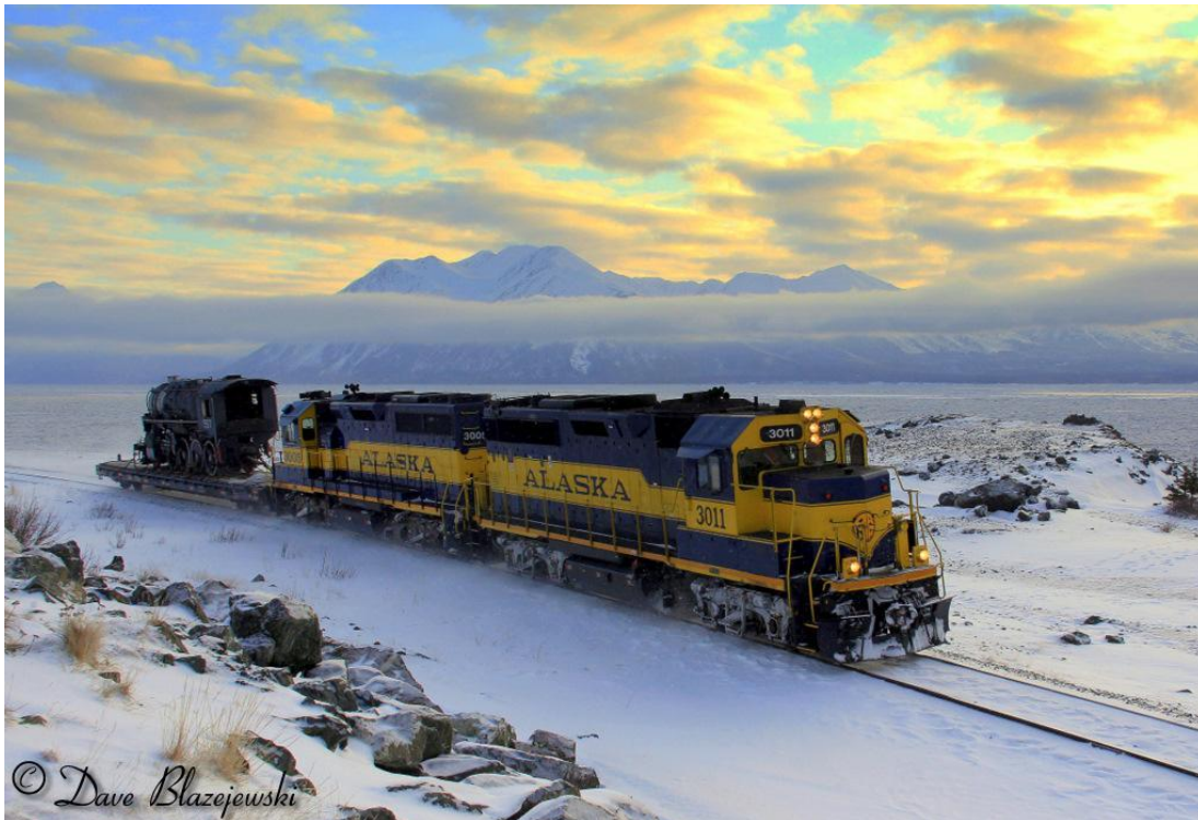
Alaska Railroad 557 rounding Beluga Point on Turnagain Arm coming home January 3, 2012.

The Alaska Community Foundation is a 501(c)(3) public charity (EIN 92-015067).