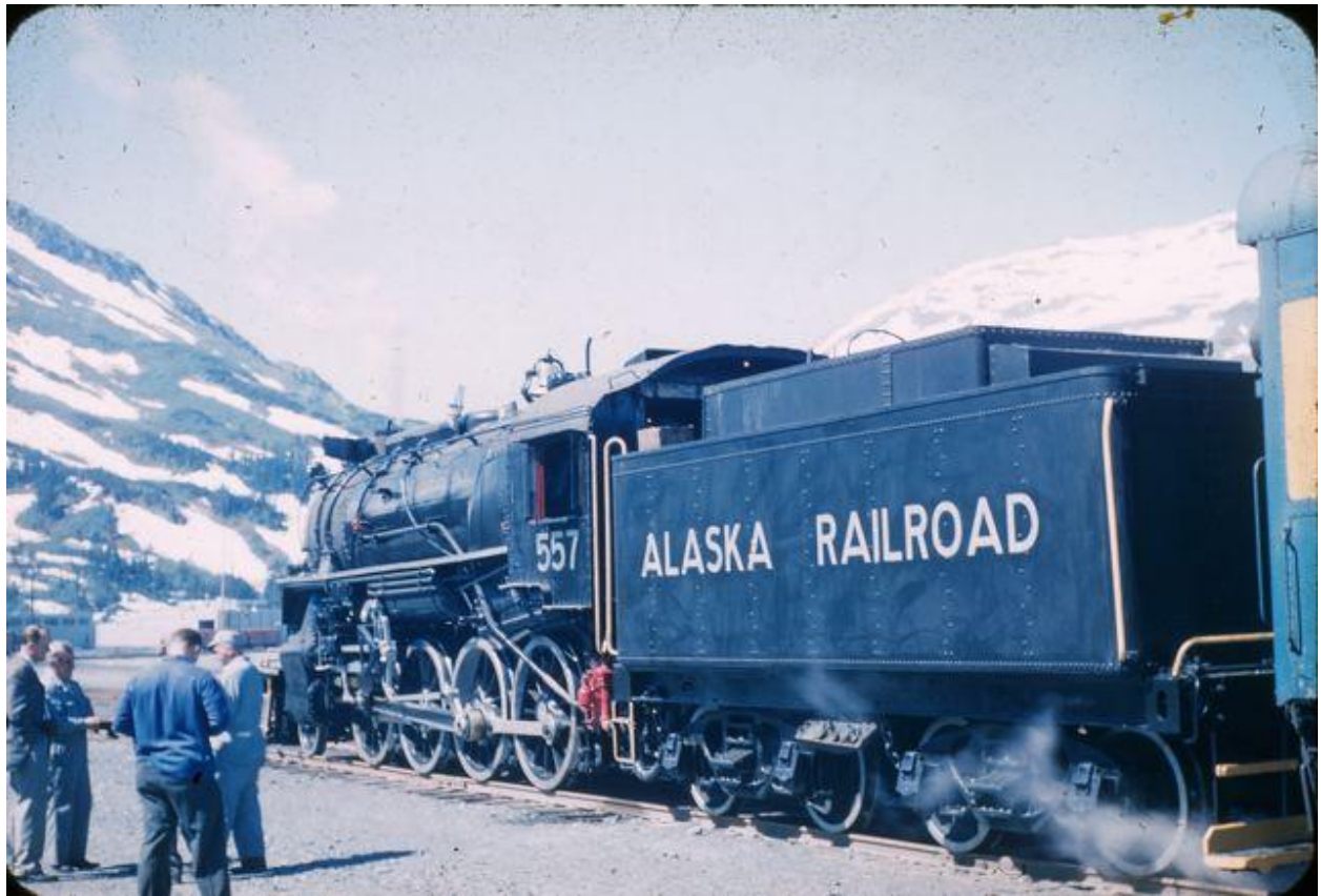
ARR 557 in Whittier, Alaska in June 1959 chartered by the California, Nevada Railroad Society.