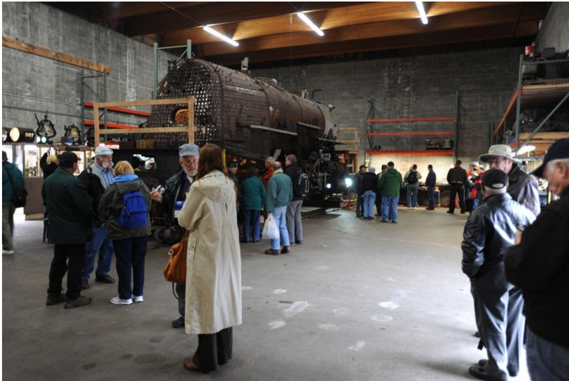
557 welcomes inspection by visitors from the National Railway Historical Society 2013 Convention in Alaska.