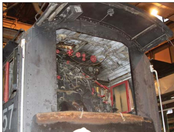
Alaska Railroad locomotive mechanics take a look under the hood shortly after the No. 557 is transported to the Anchorage Yard, where it once again its wheels were set onto Alaska Railroad tracks mid-January 2012.

But first, the locomotive must be restored. The Alaska Railroad is coordinating with several non-profit foundations and numerous volunteers to begin raising funds for the 557's refurbishment. The goal is to re-establish the 557's full classic appearance as well as bring it into compliance with today's passenger rail regulatory requirements. A preliminary cost estimate for restoration is about $500,000.