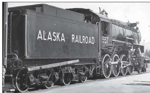
No. 557 with a tender car.