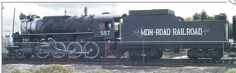
Pictured in 2001, Engine 557 retired at Poverty Museum.

Instead of scrapping the 557, Holm preserved it for school groups to witness steam engine history in action. During the 1970s and through most of the 1990s, Engine 557 was kept in running condition and parked at Holm's House of Poverty Museum in Moses Lake, Washington.