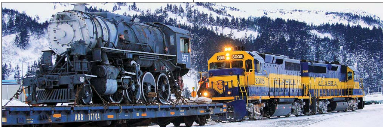
Modern SD70MAC locomotives haul the 557 to Anchorage shortly after arrival by barge in Whittier.